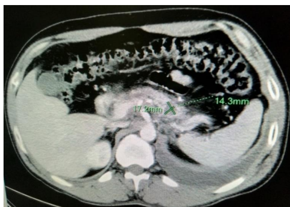
Fig. 3: CT scan showed a pancreatic pseudocyst (17.2mm * 14.3mm)