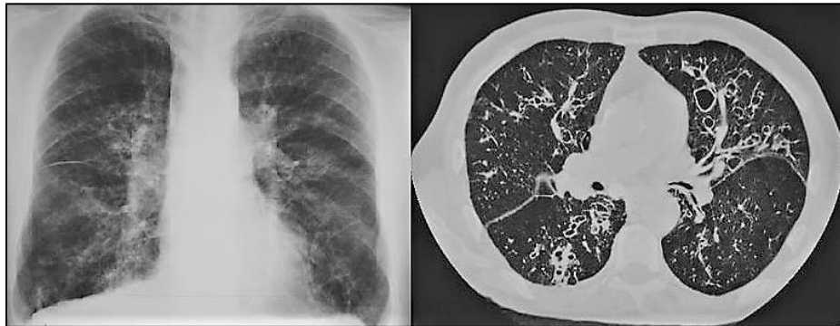
Fig. 2: Patient bilateral bronchiectasis. Comparing with chest skiagram and CT chest