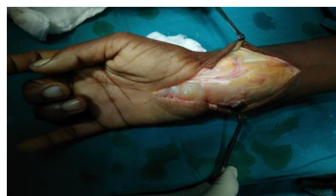
Fig. 1: Deep fascia and lesion dissected

swelling was adherent to underlying tendons of the fingers leading to contracture of the figure tendons namely flexor digitorum superficialis and flexor digitorum profundus. Chest radiograph & blood investigation was normal. A radiograph of wrist joint shows soft tissue swelling, MRI study was not done due to financial constraints of the patient. We decide to explore surgically in view of worsening of symptoms in terms of the tingling, numbness along the index finger, middle finger, which was suggestive of the compression over median nerve and limitations in movements of the fingers. Operative procedure: Surgery was done in the brachial block with an arm pneumatic tourniquet. Longitudinal incision was taken with zigzag design over the area of the wrist crease. Incision deepened, below the deep fascia and the lesion was traced [Fig. 1].