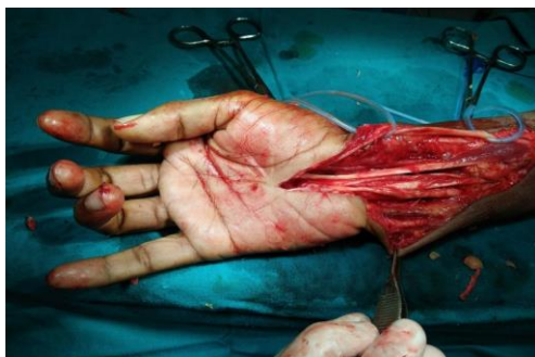
Fig. 3: All flexor tendons and median nerve freed

Excised specimen was sent for the histopathological and microbiological examinations, all flexor tendons were freed well and tension adjustment done so as to achieve the fingers cascade position [Fig. 3].