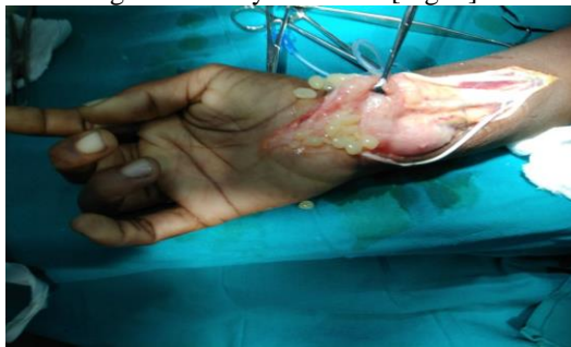
Fig. 2: Synovial sac dissected, free rice bodies (yellow colored)

of the tendons many free yellow colored rice bodies found coming out from synovial sac [Fig. 2].