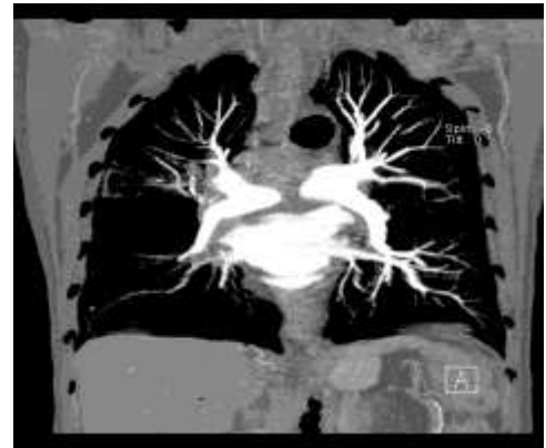
Fig. 5b: Pulmonary angiography (Coronal view) showing hypoplasia of right pulmonary artery and its branches