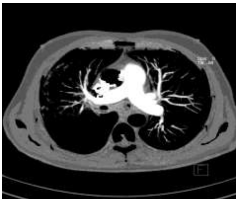
Fig. 5a: Pulmonary angiography (Axial view) showing hypoplasia of right pulmonary artery and its branches