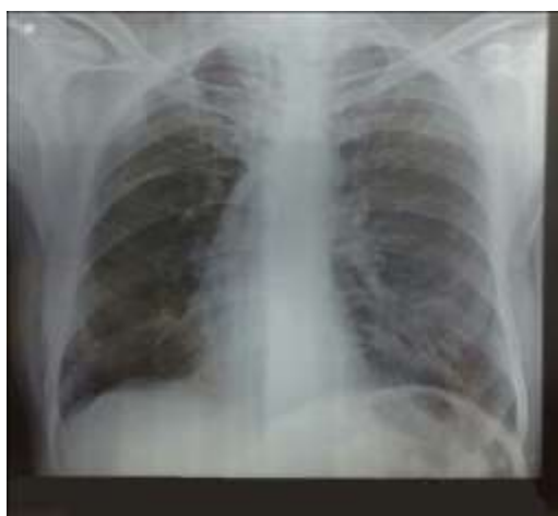
Fig. 2: X-ray Chest (repeated) showed a congested alveolar-interstitial pattern on the left side with comparatively hyper-lucent right side lung

The patient was advised admission to our unit for further management and diagnostic evaluation. Patient was initially given diuretic management (Inj. Lasix in dose of 20 mg thrice a day), antihypertensive treatment. He was given symptomatic management and also high flow supplemental oxygen with a mask. A pulmonary