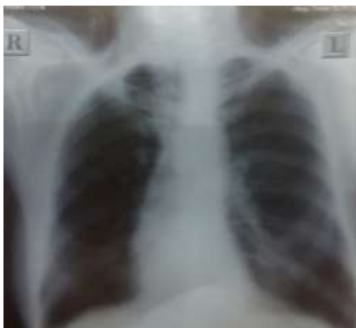
Fig. 1: X-ray chest showed right sided hyper-lucent lung

count of 225,000 per mm 3 . His oxygen saturation while breathing at room air at the time of admission was 76%. His electrocardiogram showed p-pulmonale with sinus rhythm otherwise found to be well within expected limits. Blood serum electrolytes levels, Serum Creatinine and blood urea were normal. Hepatic transaminases, bilirubin levels, blood serum alkaline phosphatase, total serum proteins and albumins were also founded to be normal. A chest X-ray on admission (Fig. 1) showed comparatively more hyper-lucent lung on the right side chest. Subsequently a repeat check chest X-ray was done showing an alveolar-interstitial congestion finding on the left side with comparatively hyper-lucent lung on the right side chest (Fig. 2).