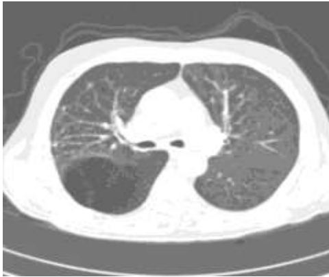
Fig. 4a: CECT Chest- Lung window (Axial view) showing hyperlucent right lung lower lobe with diminished vascularity