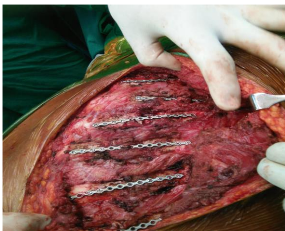
Figure 1: Operative image of fixation of flail chest using 2 MP mini plate system

site of fractures were made. Pectoralis major and latissimus dorsi muscles were divided for approaching the anterior and posterior fractures respectively. Muscle attachments from fractured ribs were cleared using electrocautery. Pleura were not entered. Debris was cleared from fracture site. Intercostal nerve bundle was protected. Fracture ends were mobilized and reduced. Mini plates were applied directly over the periosteum of the bone and were fixed with a minimum of three screws on either side of the fracture (Figure 1). Vacuum drain was placed under the dissected flap and intercostal drain was placed when needed. Layered closure of the thoracotomy was done.