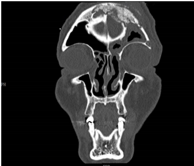
Fig. 1: CT scanhead/PNS showing frontal sinusitis with necrotic frontal bone with underlying pachymeningitis

Repeat MRI of the brain showed improvement with no increase in necrotic bone (Figure 2). However, a localised collection was observed. The collection was drained and microbiological examination revealed negative KOH, gram stain, aerobic & fungal cultures. Histopathological evaluation of the collection was also negative.