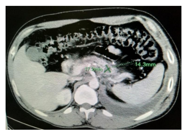
Fig. 3: CT scan showed a pancreatic pseudocyst (17.2mm * 14.3mm)