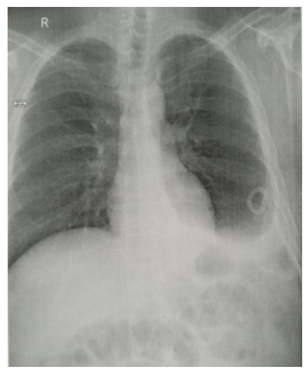
Fig. 2: Chest radiograph day 5 post pig tail insertion