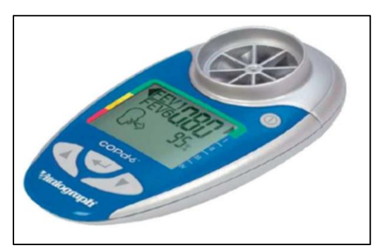
Fig. 2: COPD-6 device; Model 4000, Vitalograph

FEV1/FVC, which involves performing a prolonged forced vital capacity maneuver (FVC). It is easier to use and requires no special training. The maneuver performed is similar to that of a spirometry. The patient takes a deep breath, then will insert the mouthpiece into the mouth and exhale vigorously and continuously for six seconds. The device emits a beep after 6 seconds to indicate that the patient can stop the maneuver. The cut-off point for the FEV1/FEV6 quotient is established between 0.75-0.80 [11]. This study considers FEV1/FEV6<0.75 as the cutoff. While FEV1/FEV6 greater than this value rules out obstruction with acceptable confidence, a lower result is an indication for a conventional spirometry study to confirm the diagnosis of COPD.