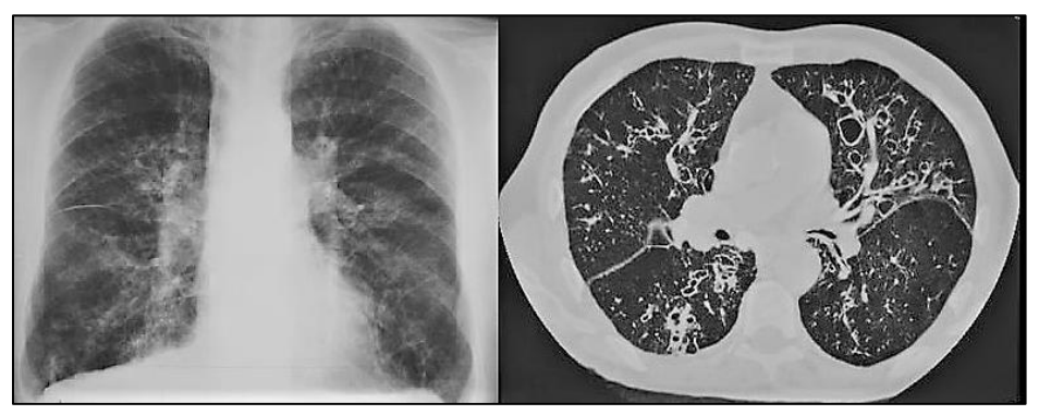
Fig. 2: Patient bilateral bronchiectasis. Comparing with chest skiagram and CT chest