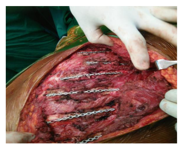
Figure 1: Operative image of fixation of flail chest using 2 MP mini plate system

site of fractures were made. Pectoralis major and latissimus dorsi muscles were divided for approaching the anterior and posterior fractures respectively. Muscle attachments from fractured ribs were cleared using electrocautery. Pleura were not entered. Debris was cleared from fracture site. Intercostal nerve bundle was protected. Fracture ends were mobilized and reduced. Mini plates were applied directly over the periosteum of the bone and were fixed with a minimum of three screws on either side of the fracture (Figure 1). Vacuum drain was placed under the dissected flap and intercostal drain was placed when needed. Layered closure of the thoracotomy was done.