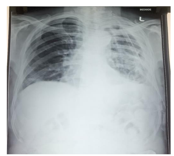
Fig. 3a: Follow-up chest radiographs