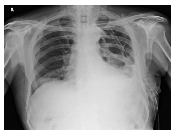
Fig. 1b: Post ICD chest radiograph