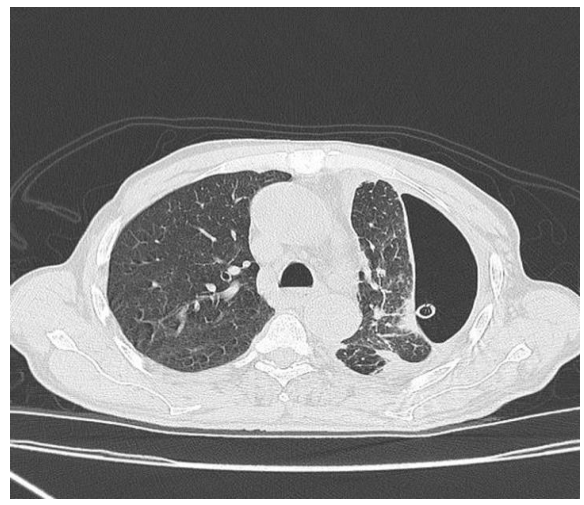
Fig. 2a: CT thorax showing BPF and left ICD in situ