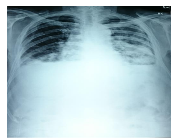
Fig. 1a: Chest radiograph showing left hydropneumothorax

There were no complications, as evident by the followup chest radiographs at one month (Fig. 3a & 3b). A written informed consent was obtained from the patient for the publication of this case details and accompanying images.