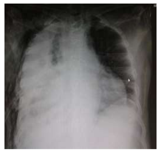
Fig. 1: Chest radiograph shows homogenous opacification of the right hemithorax

confirmed the diagnosis of pseudomyxoma pleurii<sup>1</sup>. He is doing well in follow up at two years and chest radiograph shows clear right lung fields. (Fig. 4)