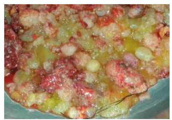
Fig. 2: Mucinous pleural implants excised during surgery