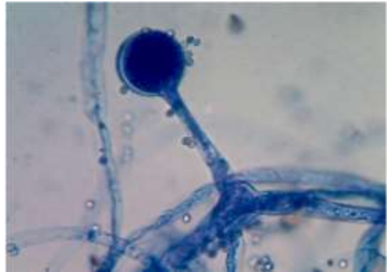
Fig. 3 b: High power 40X microscopy shows the sporangium