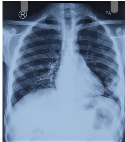
Fig. 1: Left lower zone pneumonia with cystic bronchiectasis

and was started on ATT. He responded well with resolution of symptoms and is on continuation of ATT treatment. Hence, we presented this case as an unusual etiology of bronchiectasis – CVID complicated with left lower lobe COP/GLILD and right sided tubercular pleural effusion.