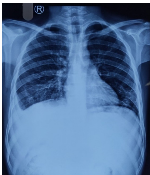
Fig. 3: Chest X-ray showing left lower zone resolving consolidation and right pleural effusion

criteria CVID is usually detected after 2 years of age. ESID criteria needs decreased ( < 2 standard deviations of the mean) levels of IgG with reduced IgA and/or IgM, together with failure to mount a significant antibody response to vaccination, in the absence of a known cause. 6,8 Here we were able to diagnose him at 16 years of age, that too only 20% cases are diagnosed < 20 years of age. 1 His serum Ig levels were lower, showing IgG < 270 mg/dl (level 700–1600mg/dl), IgE 2.1KU/L (level 0–113KU/L), IgM < 15 mg/dl (level 40–230mg/dl), and IgA 13mg/dl (level 70–400mg/dl) done by Nephelometry.