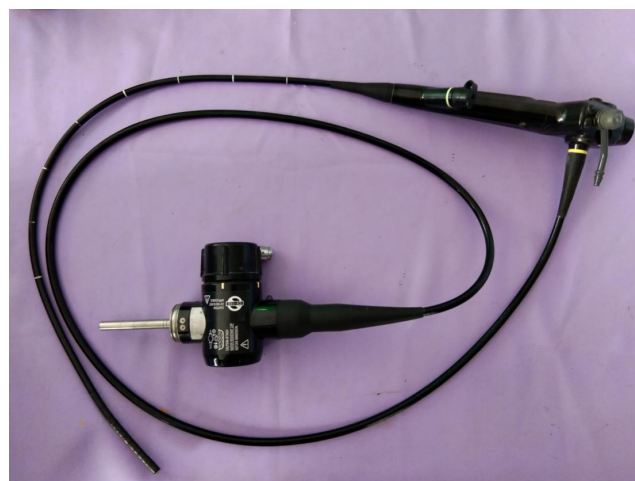
Fig. 1: Flexible fiberoptic video bronchoscope (OLYMPUS BF TYPE 1T150 model)

The procedure was done using a flexible fiberoptic video bronchoscope (Olympus Bf Type 1T150 model) (Figure 1) in a well-equipped bronchoendoscopy room.